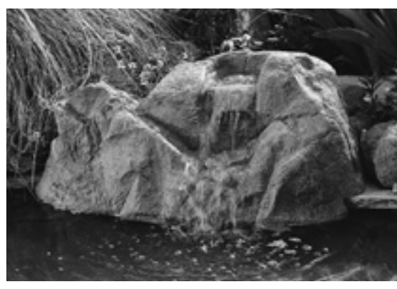
Part # 4100 Part # 4100T (includes pump & plumbing for pond use)

We recommend the following accent boulders be matched with this waterfall for an extended natural zone: ACCENT BOULDERS: 8100 (2 Boulders)