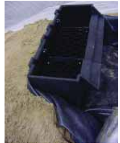
The liner goes under the spillway and wraps up the back and ends.

On the incoming side you will need to hold the liner up to the end of the tub and mark where the bulkhead hole is. Cut a hole in the liner slightly smaller than the opening. Set the spillway tub in place and push the body of the bulkhead thru from the inside (be sure rubber gasket is in place inside the tub). Stretch the liner over the bulkhead and then install the washer and the nut. Tighten the nut snugly but do not overtighten. This will create a waterproof seal thru the liner.