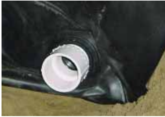
Bulkhead is thru liner, washer and nut are tightened and PVC adapter is installed.

On the incoming side you will need to hold the liner up to the end of the tub and mark where the bulkhead hole is. Cut a hole in the liner slightly smaller than the opening. Set the spillway tub in place and push the body of the bulkhead thru from the inside (be sure rubber gasket is in place inside the tub). Stretch the liner over the bulkhead and then install the washer and the nut. Tighten the nut snugly but do not overtighten. This will create a waterproof seal thru the liner.