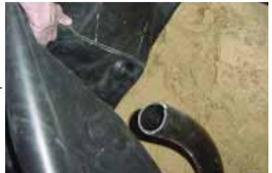
Stretch liner over bulkhead then tighten washer and nut onto bulkhead

Remove the channel grating from the top of the spillway. There are openings on both ends of the spillway for water to enter. You will need to decide which end is more convenient for your application. First you need to plug the opening you will not be using. Install the bulkhead fitting with the body and the rubber gasket on the inside of the tub. Tighten the plastic washer and the nut from the outside. Install pvc plug on the inside of the tub and tighten. If you are using a large spillway often times water will come in from both ends in which case you would not use the plug but rather install a pvc male adapter on the outside of the bulkhead.