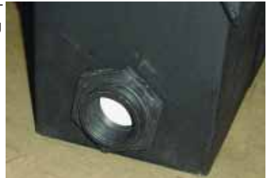
Photo shows bulkhead fitting and plug installed in the end of the spillway.

Before installing spillway, double check that the soil under the spillway is compacted and level from side to side (this ensures an even flow of water over the lip). Lay the liner from the stream over the soil where the spillway will sit.