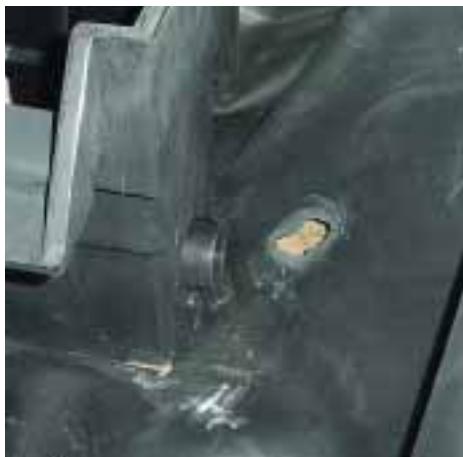
Hold bulkhead to spillway and cut hole in liner just smaller than bulkhead.

Remove the channel grating from the top of the spillway. There are openings on both ends of the spillway for water to enter. You will need to decide which end is more convenient for your application. First you need to plug the opening you will not be using. Install the bulkhead fitting with the body and the rubber gasket on the inside of the tub. Tighten the plastic washer and the nut from the outside. Install pvc plug on the inside of the tub and tighten. If you are using a large spillway often times water will come in from both ends in which case you would not use the plug but rather install a pvc male adapter on the outside of the bulkhead.