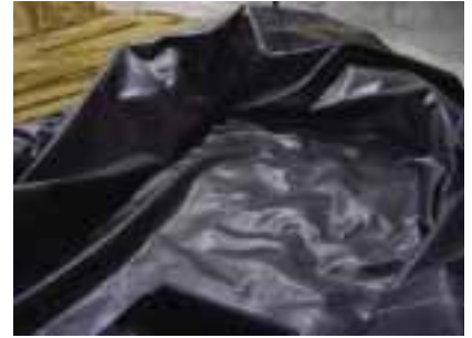
The liner covers the stream bed and goes thru the area where the spillway will set.

Once you have sculpted the reservoir, stream and waterfall area carefully check for any rocks, roots or sharp objects in the soil. After ensuring the area is free from objects you can install the underlayment thru the reservoir and stream area. After installing the underlayment you can install the liner as well. Do not be concerned with a few wrinkles in the liner since the whole area will be filled in with rock and covered. Be sure to pull any extra liner towards the waterfall area.