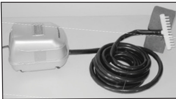
AP-40 with an added hose section and included air diffuser

NOTE: In winter, damp air can condense onto the inside wall and freeze the hose. This can eventually block the hose completely therefore it is important to check frequently during periods of freezing temperatures.