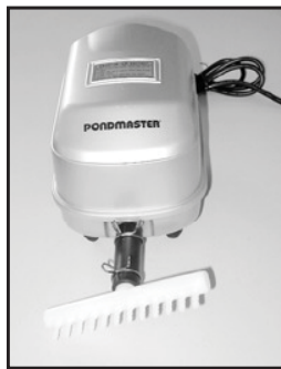
AP-40 with included air diffuser and short hose section