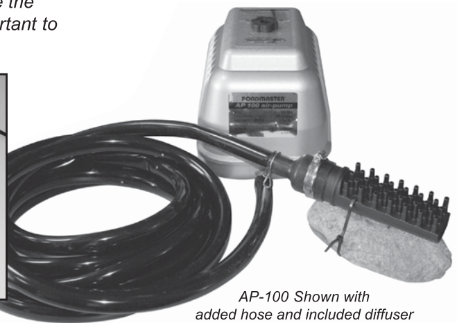
AP-100 Shown with added hose and included diffuser