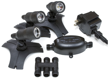
3 Pack Fountain Light Kit Blue Thumb Item# PB2897