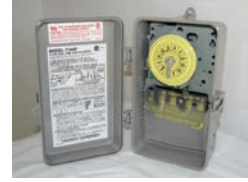
230V Timer Part #20039