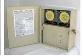
Timing Center Part #20040