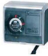
115V Timer Part #20036

Save energy while extending the life of your fountain! Timers available for 115v and 230V motors. The Timing Center by Intermatic contains two timers in one steel outdoor enclosure.