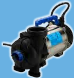
AquaScapePRO Pond Pumps