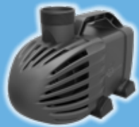
EcoWave Pond Pumps