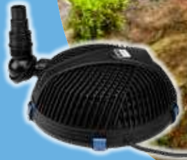
AquaForce® Pond Pumps