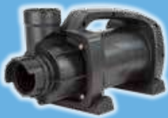
SLD Adjustable Flow Pond Pumps