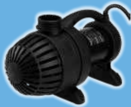
AquaSurge® Pond Pumps