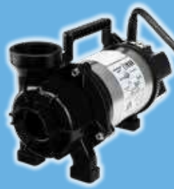
PL and PN Pond Pumps